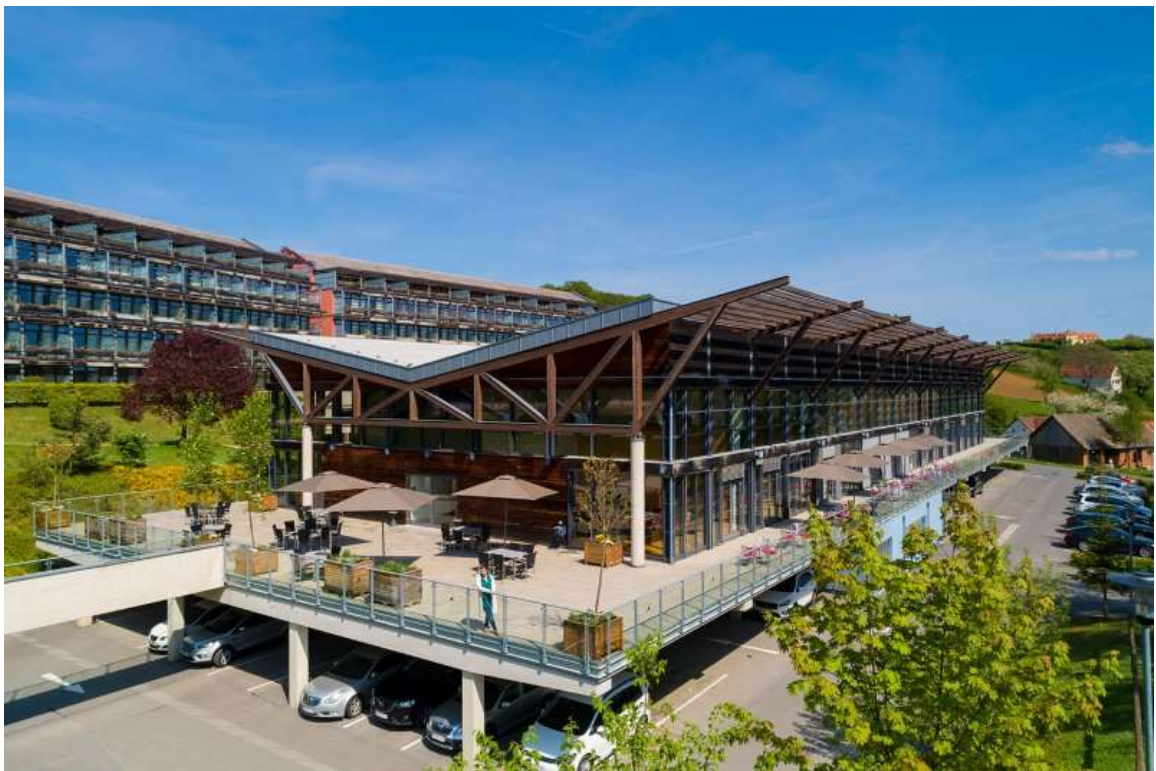
Congress Loipersdorf, Schaffelbadstraße 220, 8282 Bad Loipersdorf (Finals, medal bouts)

CONGRESS LOIPERSDORF SEMINAR | EVENT | MEETING